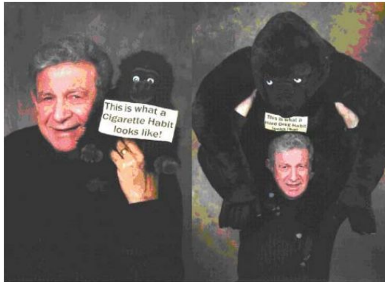
This is what a Cigarette Habit looks like!

Do you know what a drug habit looks like? Here is a five foot gorilla on my shoulder