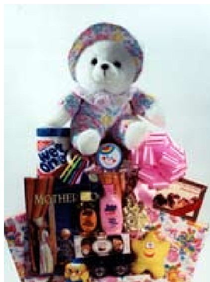
New Baby Gift Basket