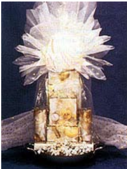
Happy Cooker Gift