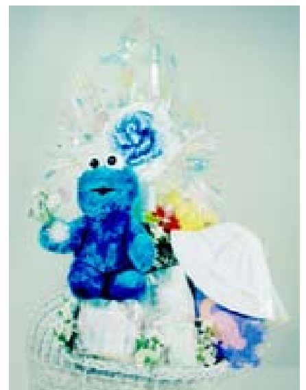
Cookie Monster Baby Basket