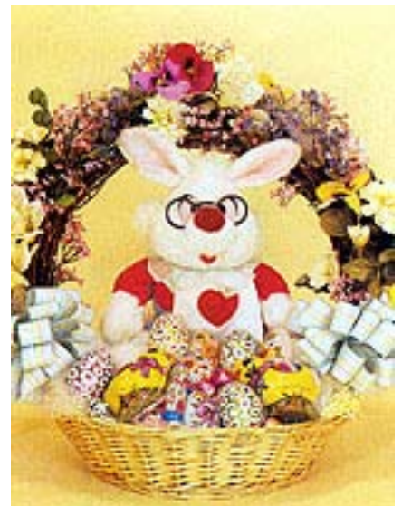
Candy Business Magazine