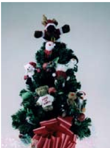
Bears in Tree Basket