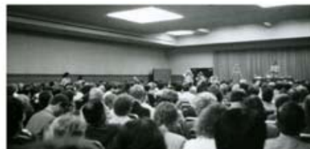
30th Seminar in Los Angeles