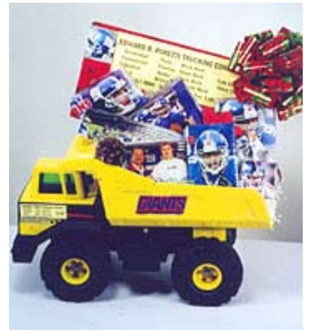
New York Giants Corporate Dump Truck