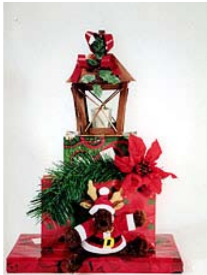
Giftware News Magazine