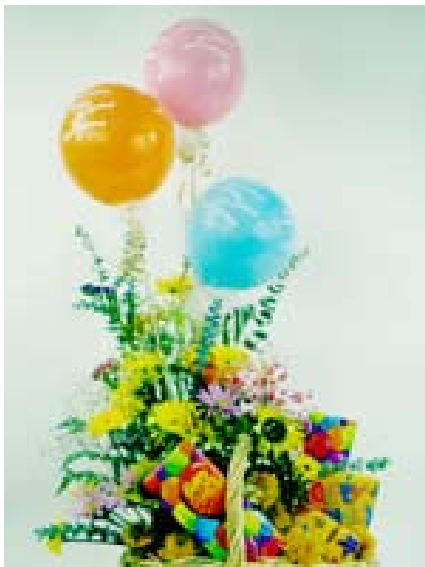
Birthday in a Basket