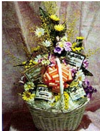
Fancy Food Magazine