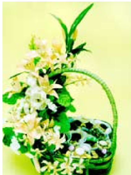
Elegant Easter Basket