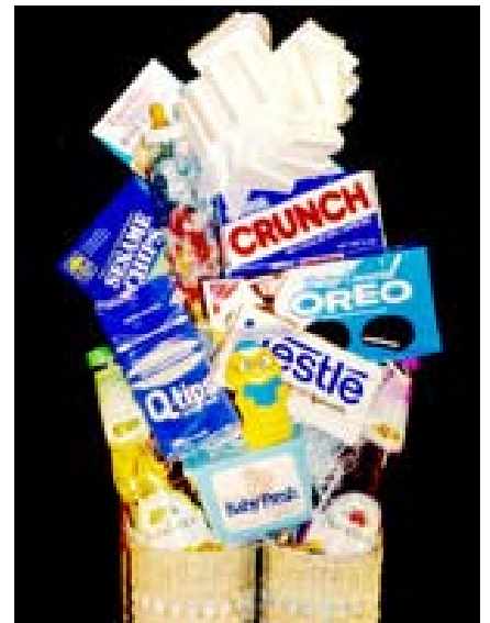
Mom's Late Night Survival Basket