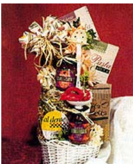
Pasta & Sauce Gift