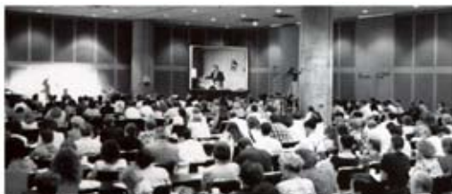
80th Symposium in New York Javits Ctr.

Below are two of my largest Seminar and Symposium audience photos at the International Fancy Food and Confection Shows in New York and Los Angeles.