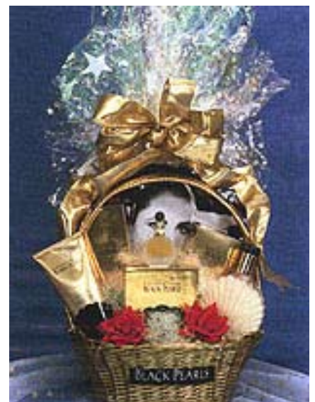
White Diamonds Gift