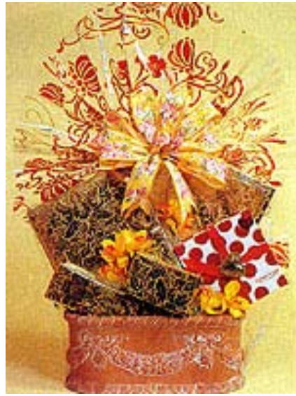
Harry London Candies