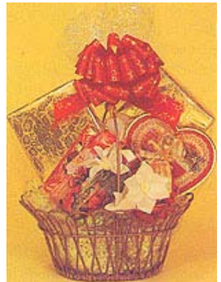
Valentines Day Gift