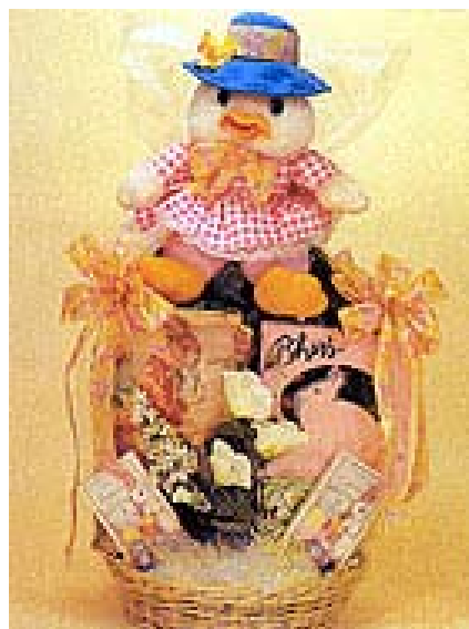
Happy Easter Gift