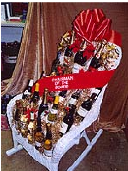
Chairman of the